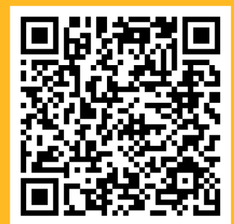
Mountain Line App: Android