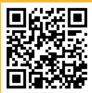
PRT Terminal Locations