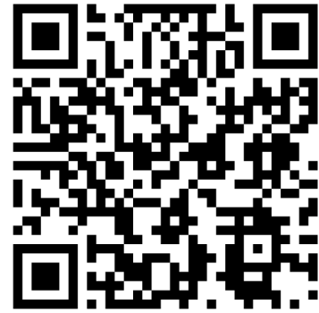
Undergraduate Social Work Organization Facebook and Instagram