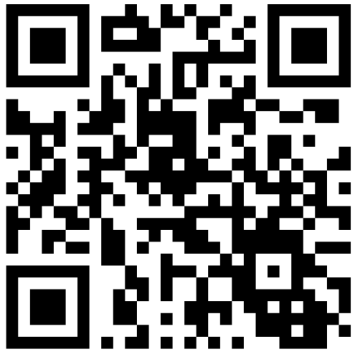
WVU School of Social Work Facebook & Instagram